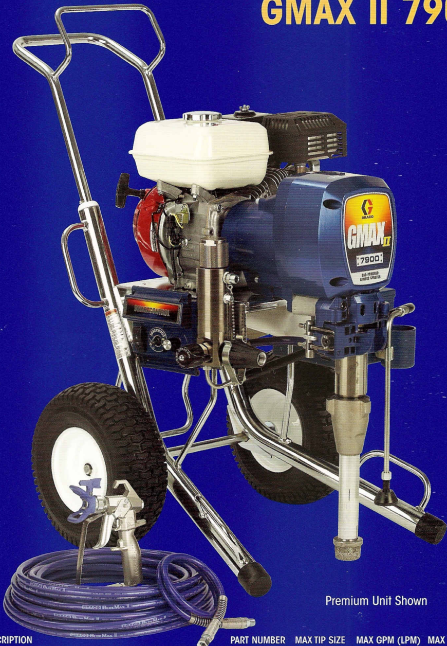
Premium Unit Shown