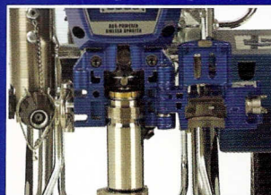
Exclusive ProConnect System – no-tools removal and installation for fast repairs on the job.