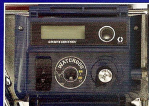
SmartControl provides high quality spray pattern plus the WatchDog Pump Protection System.